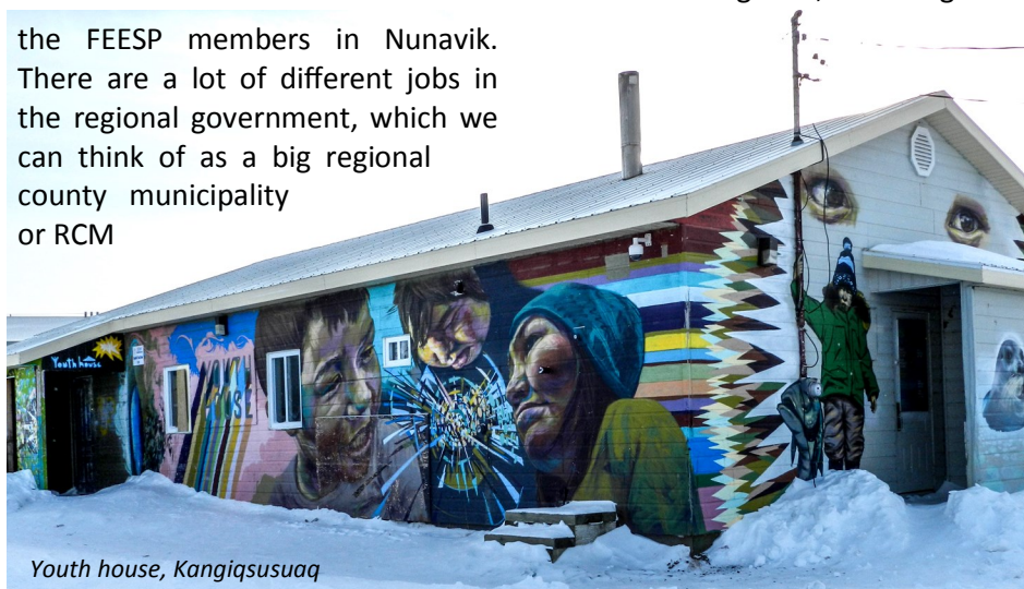
Youth house, Kangiqsujaq

the FEESP members in Nunavik. There are a lot of different jobs in the regional government, which we can think of as a big regional county municipality or RCM