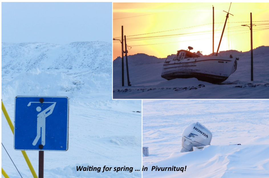
Waiting for spring ... in Pivurnituq!

If you want to hear Inuktitut and learn a few words or phrases, check this site : http://www.tusaalanga.ca/fr .